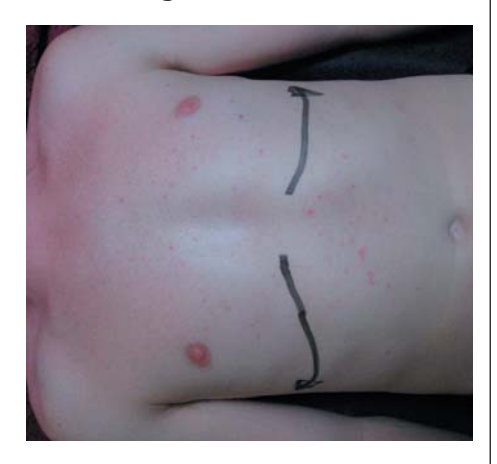
Figure 2: Bellows breathing