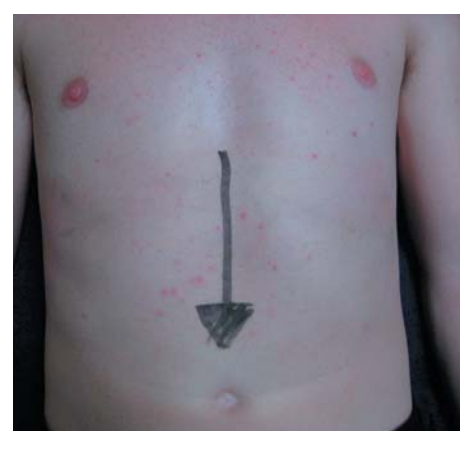
Figure 2: Piston breathing