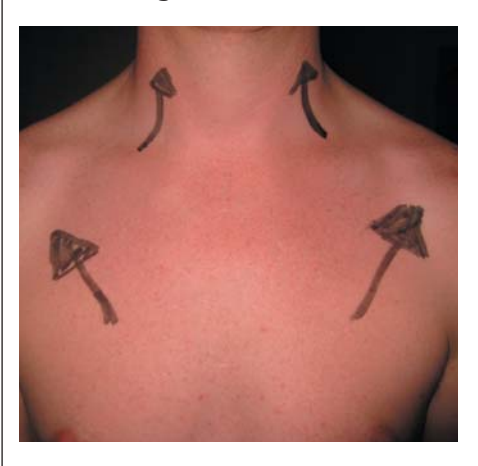
Figure 2: Siphon breathing